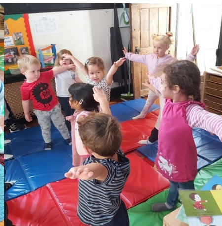
Yoga in the Pre-school Study