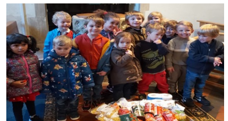
The Pre-School children delivering our Food Bank donations

Thank you to all families who have donated food for our local Food Bank. The pre-school children will be delivering it to the church next door. It has generated some worthwhile conversations about why we support this charity and the children have shown maturity and sensitivity during these discussions.