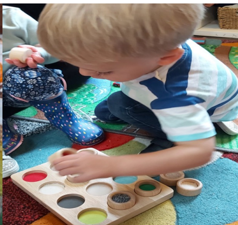
Puzzle time in the Toddler Den