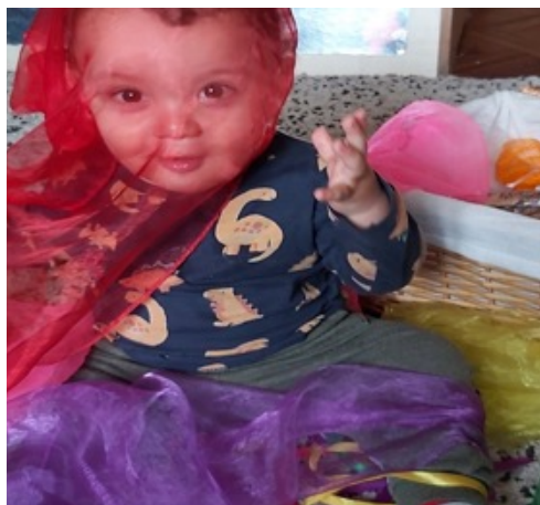
Peek A Boo in the Baby Snug!